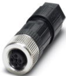
Connector, 5-position, Socket straight M12, A-coded, Spring-cage connection, knurl material: Zinc die-cast, nickel-plated, external cable diameter 4 mm ... 8 mm

Please be informed that the data shown in this PDF Document is generated from our Online Catalog. Please find the complete data in the user's documentation. Our General Terms of Use for Downloads are valid ( http://phoenixcontact.com/download )