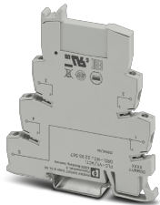
VARIOFACE feed-through terminal block (3-conductor screw connection), for PLC-INTERFACE actuator series

Please be informed that the data shown in this PDF Document is generated from our Online Catalog. Please find the complete data in the user's documentation. Our General Terms of Use for Downloads are valid ( http://phoenixcontact.com/download )