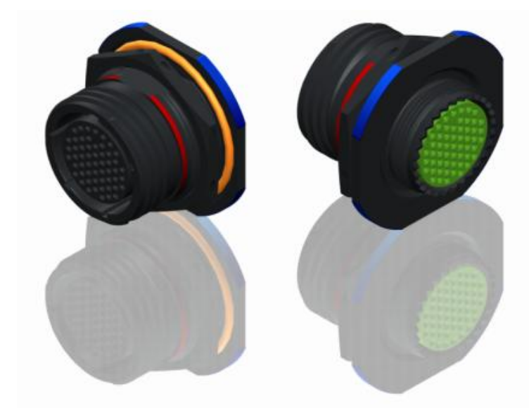
LAYOUT SHOWN AS EXAMPLE