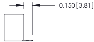
554 Contact Code