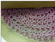
Packaging Before Proposed Change, Prior to Shipping.