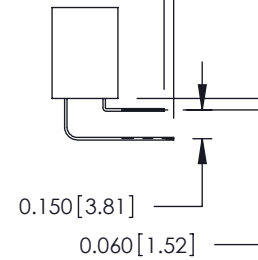
559 Contact Code

0.240 [6.10] Up to 27/54 Pin 0.162 [4.11] 28/56 and Over 0.290 [7.37] Up to 27/54 Pin .212 [5.38] 28/56 and Over