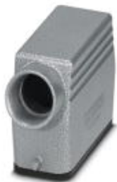
HEAVYCON sleeve housing D15, for single locking latch, height 53 mm, with support 1x M20, lateral conductor exit

Please be informed that the data shown in this PDF Document is generated from our Online Catalog. Please find the complete data in the user's documentation. Our General Terms of Use for Downloads are valid ( http://phoenixcontact.com/download )