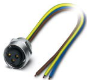
Sensor/actuator flush-type socket, 3-pos., 7/8", front mounting with Pg13.5 thread, with 0.5 m PVC litz wire, 3 x 0.75 mm 2

Please be informed that the data shown in this PDF Document is generated from our Online Catalog. Please find the complete data in the user's documentation. Our General Terms of Use for Downloads are valid ( http://phoenixcontact.com/download )