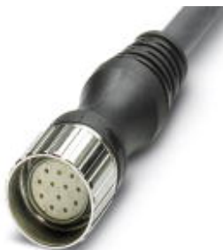
M23 socket, straight, 12-pos., with 5 m master cable, pin 9 and 10 bridged

Please be informed that the data shown in this PDF Document is generated from our Online Catalog. Please find the complete data in the user's documentation. Our General Terms of Use for Downloads are valid ( http://phoenixcontact.com/download )