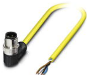
Sensor/actuator cable, 4-position, PVC, yellow, Plug angled M12 SPEEDCON, A-coded, on free cable end, cable length: 5 m

Please be informed that the data shown in this PDF Document is generated from our Online Catalog. Please find the complete data in the user's documentation. Our General Terms of Use for Downloads are valid ( http://phoenixcontact.com/download )