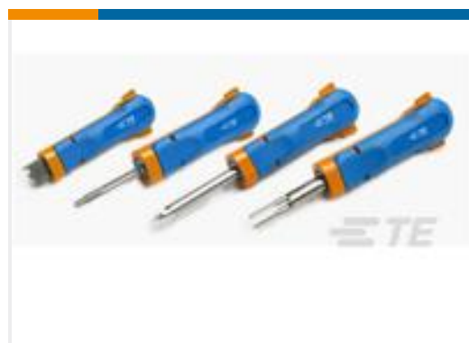
TE Part #1579007-8 EXTRACTION TOOL