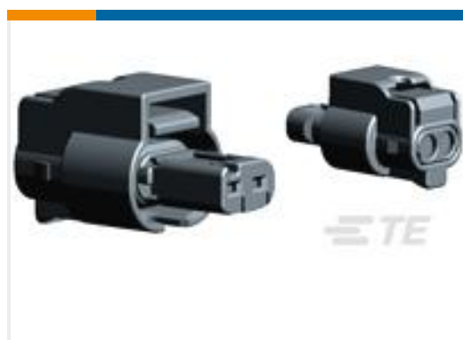
TE Part #1-1924067-3 2POS, MCON 1.2 CB REC 2p TL SEALED