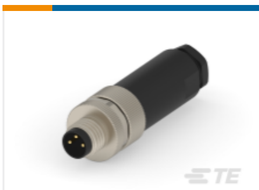
TE Part #T4011008031-000 M8,SCREW, MALE,S,UNSHIELD,3P, GOLD