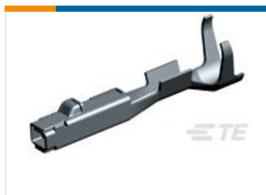
TE Part #1418850-3 MCON 1.2 CB REC SWS AG