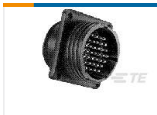
TE Part #206151-3 CPC RECPT SEALED SIZE 23-37