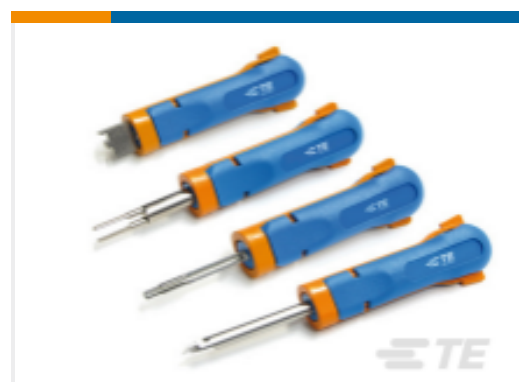
TE Part #2844610-1 EXT TOOL, MCON 1.2 CB