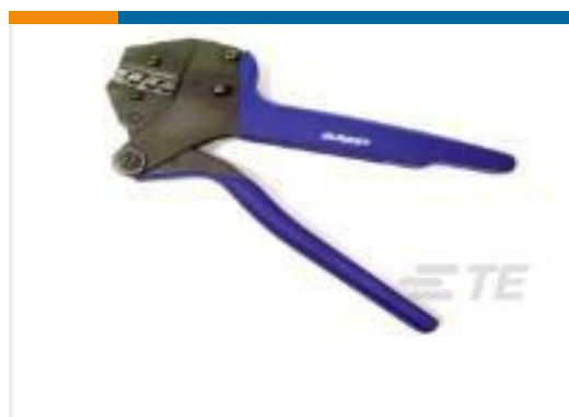
TE Part #539635-1 ERGO HAND TOOL FRAME W/O DIES