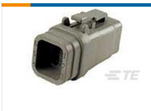
TE Part #DTM06-6S-E007 PLG, 6P, GRY, N, XCAP