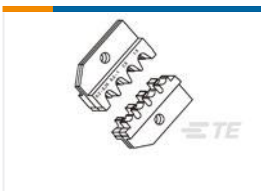
TE Part #539773-2 DIE FUER MINI MIC