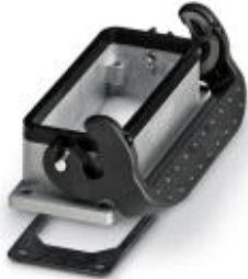
The figure shows the product version HC-B 16-AML

HEAVYCON panel mounting base HV6, with single locking latch, height 27 mm